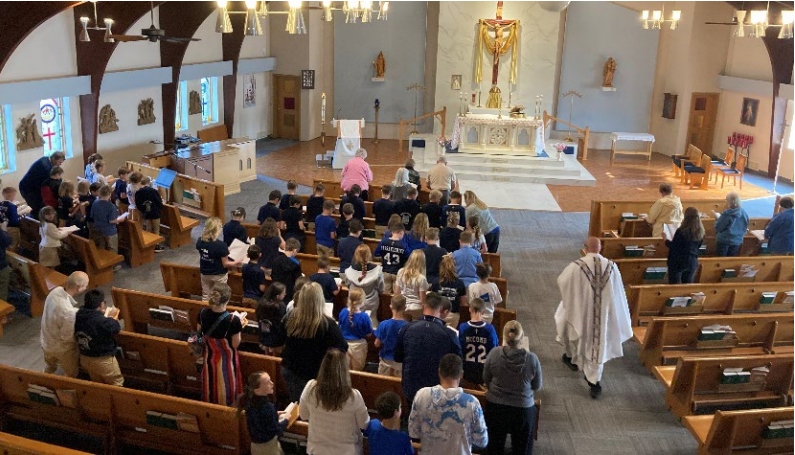
Visitation of our Father Solanus Center by Gaylord St. Mary’s School!